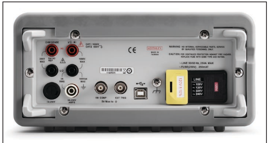
Model 2100 rear panel

AC CMRR: 70dB (for 1kΩ unbalance LO lead). POWER SUPPLY: 120V/220V/240V. POWER LINE FREQUENCY: 50/60Hz auto detected. POWER CONSUMPTION: 25VA max. DIGITAL I/O INTERFACE: USB-compatible Type B connection. ENVIRONMENT: For indoor use only. OPERATING TEMPERATURE: 5° to 40°C. OPERATING HUMIDITY: Maximum relative humidity 80% for temperature up to 31°C, decreasing linearly to 50% relative humidity at 40°C. STORAGE TEMPERATURE: –25° to 65°C. OPERATING ALTITUDE: Up to 2000m above sea level. BENCH DIMENSIONS (with handles and feet): 112mm high × 256mm wide × 375mm deep (4.4 in. × 10.1 in. × 14.75 in.). WEIGHT: 4.1kg (9 lbs.). SAFETY: Conforms to European Union Directive 73/23/ECC, EN61010-1. EMC: Conforms to European Union Directive 89/336/EEC, EN61326-1. WARRANTY: One year.